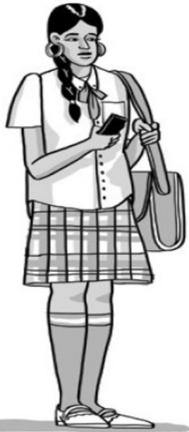
Sofia, an adolescent

I have to go to different places for mine and my son's treatment.